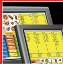
User changeable LCD display