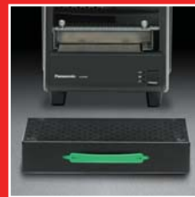
Field replaceable hard drive