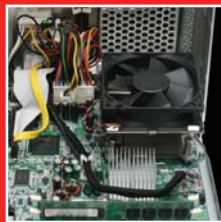
Highest speed processor